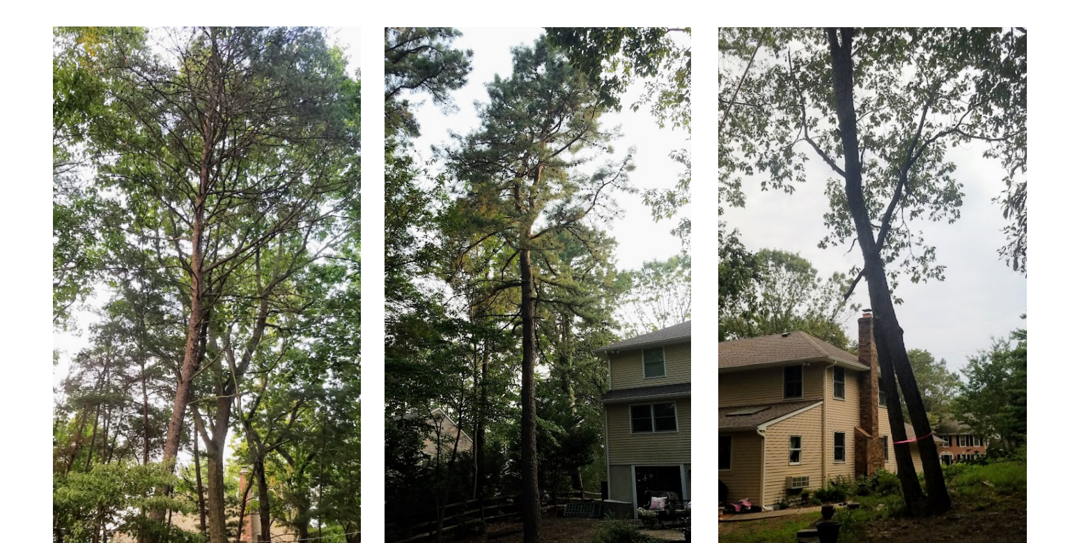
Tree #2 - Dead